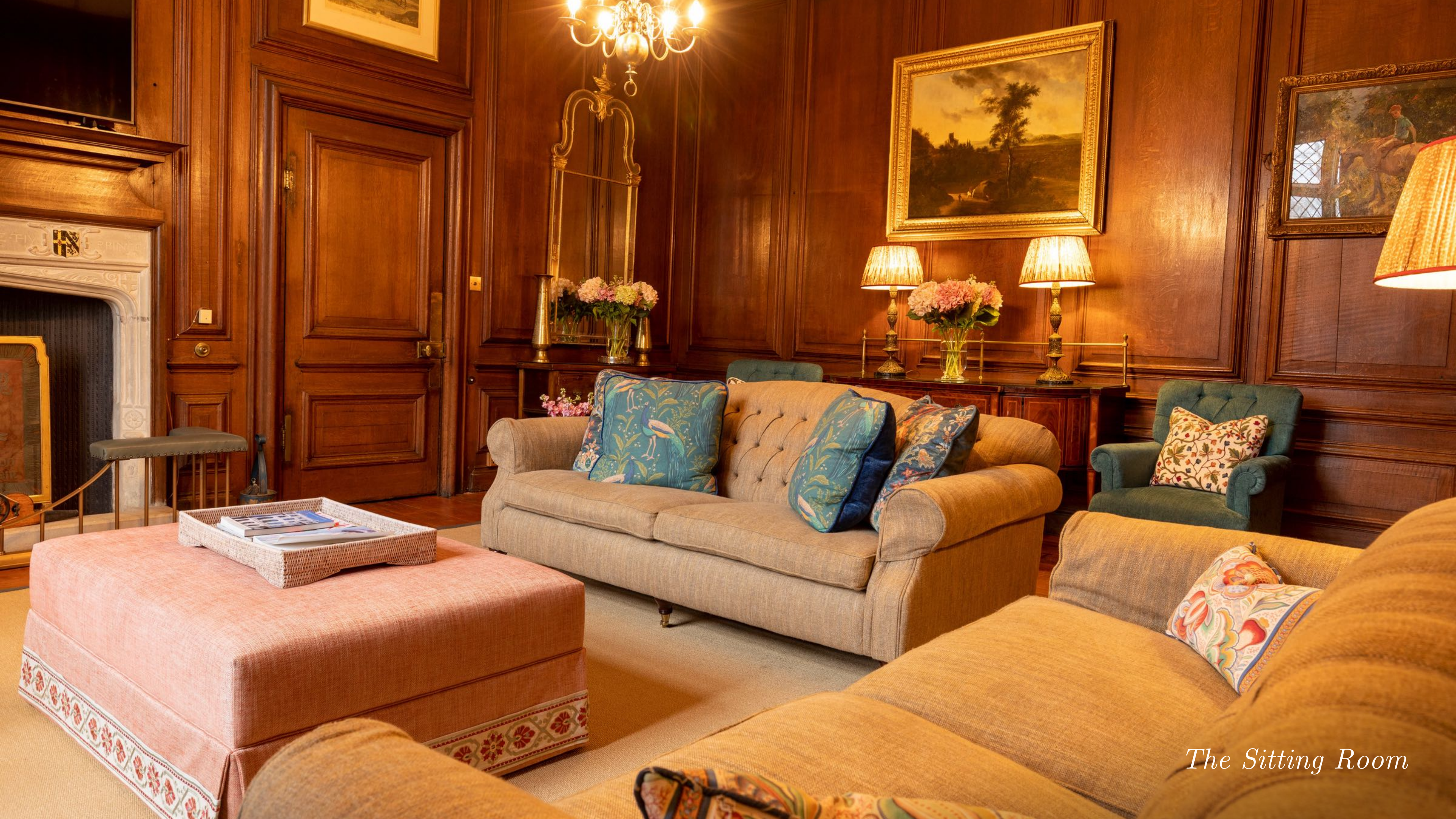
The Sitting Room